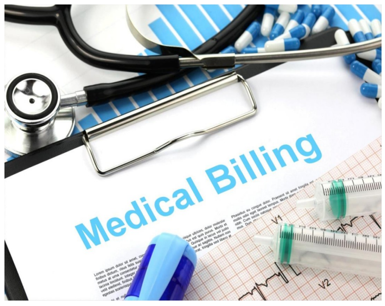
2023 Annual Report Page 11