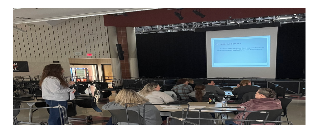
2023 Food Borne Outbreak Training West Portsmouth School