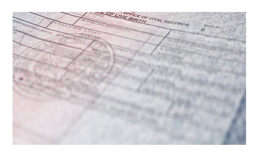
Scioto County Health Department