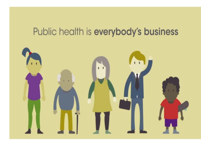
2023 Scioto County Fair Booth